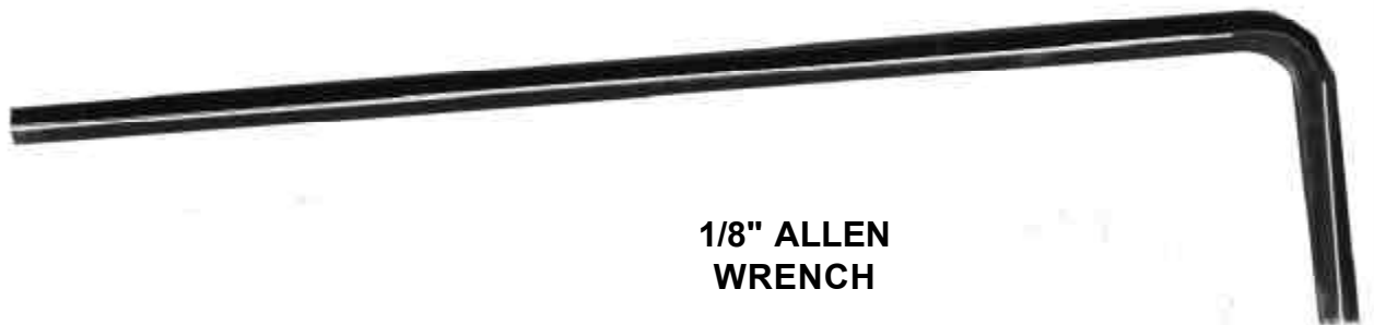
1/8" ALLEN WRENCH